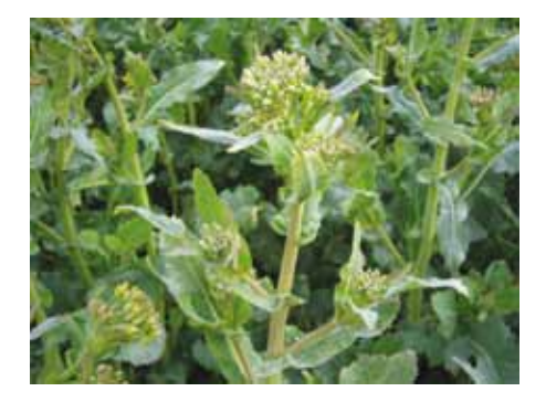
Yellow bud growth stage