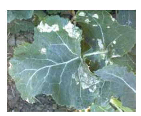
Light leaf spot (Pyrenopeziza brassicae)