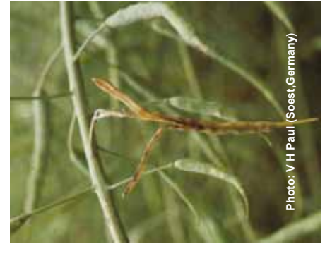
Splitting of an oilseed rape pod due to brassica pod midge larval feeding