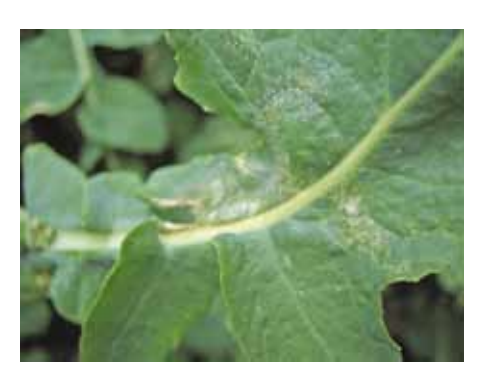
Light leaf spot close up of lesion ( Pyrenopeziza brassicae )