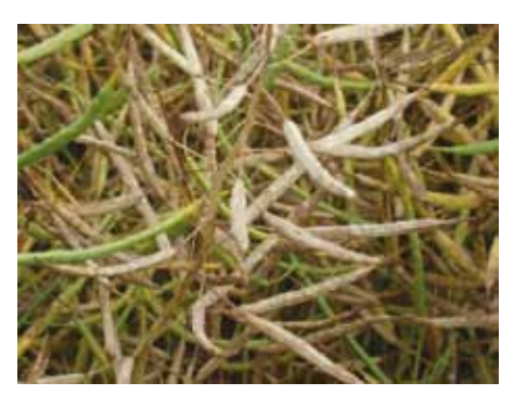
Botrytis on pods (Botrytis cinerea)