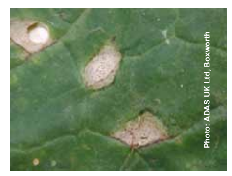
Phoma leaf spot (Phoma lingam)