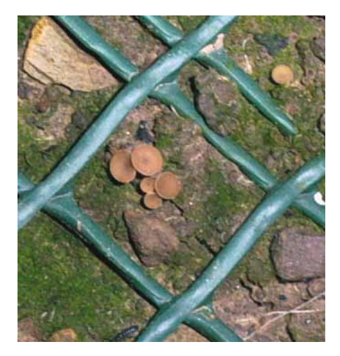
Sclerotinia apothecia ( Sclerotinia sclerotiorum )