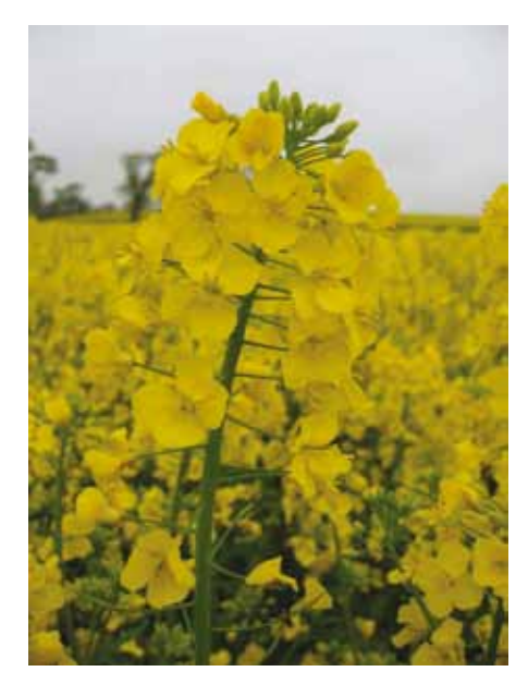
Full flower growth stage