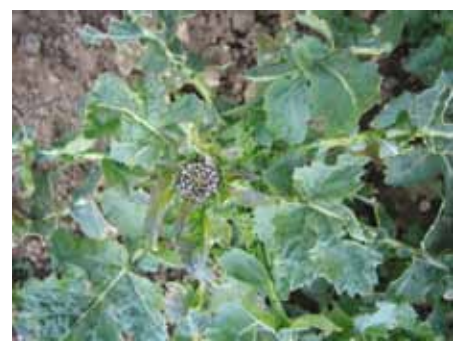
Green bud growth stage