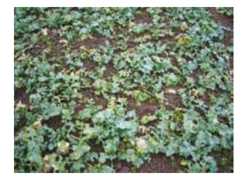
Leaf production growth stage