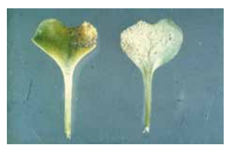
Downy mildew (Peronospora parasiticia)