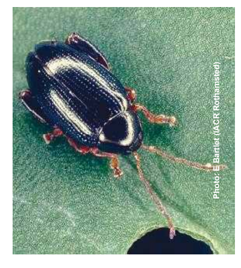
Cabbage stem flea beetle