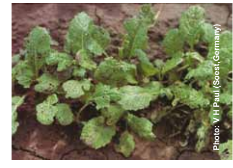
Flea beetle damage