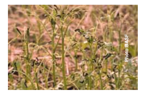
Turnip sawfly larvae