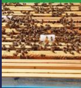
Figure 30: Synthetic pesticide strips applied to a colony in autumn

Please ensure that spent medicines, eg, varroacides are disposed of responsibly and in accordance with the product information.