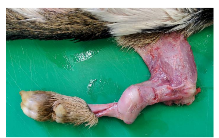
Figure 6 - Forearm deformity due to congenital radial hemimelia in a pygmy goat