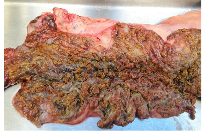
Figure 2 – Granulomatous colitis in a finishing animal with Johnes disease