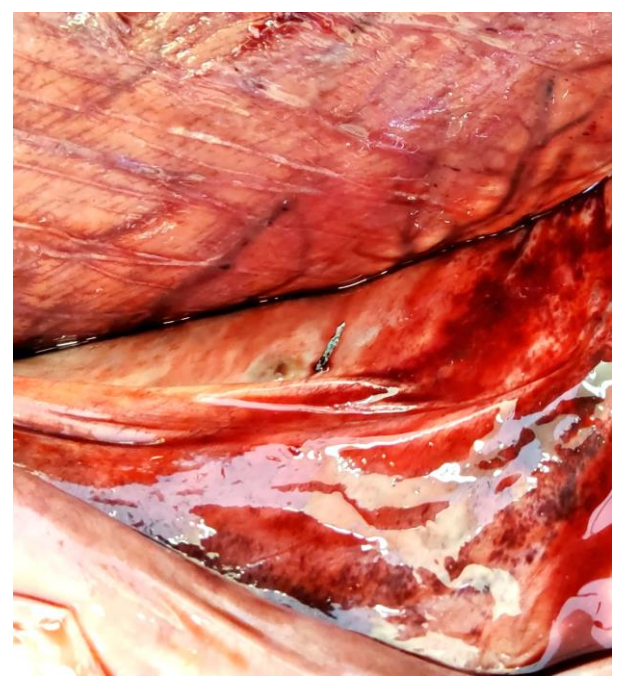
Figure 3 - Tyre wire pentrating through the pericardium

penetrating through the diaphragm and pericardium (Fig 3). A roughened area was visible on the adjacent left ventricular epicardium, but a significant pericarditis had not yet developed. No lesions were noted in the reticulum. It was postulated that contact between the wire and the epicardium could have triggered a fatal cardiac arrhythmia. Possible precipitating factors for penetration of the pericardium included changes in abdominal pressure during late gestation or difficulty rising and abnormal gait as a consequence of lameness.