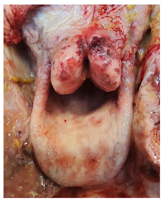
Figure 1 – Coalescing ulcerative lesions on the arytenoid cartilages due to infection with bovine herpes virus-1