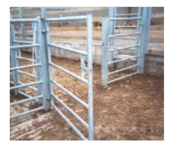
Figure 3: Ensure that gates can not be accidentally closed as cattle move out of the pen.