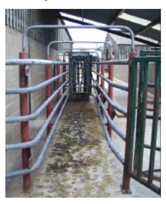
Figure 1: An example of a handling system incorporating some of the features commonly found on Scottish beef farms

Permanent handling systems used in Scotland have changed little in recent decades. A survey of 139 Scottish beef farmers, undertaken in 2004 by SAC, showed that the majority of systems currently in use have one or more large collecting pens leading to a straight-sided forcing pen and a straight, open-sided race, as in Figure 1.