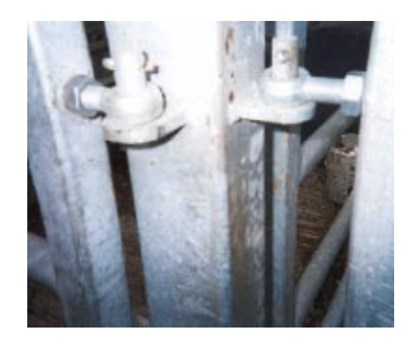
Figure 4: Hinge pintles may need to be moved to allow gates to open fully