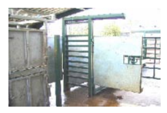
Figure 6: An arrangement of gates which protects handlers working at the rear of a crush. Note that that sliding barred gate should ideally be sheeted.