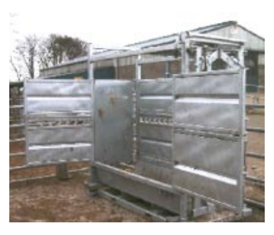
Figure 7: An example of a crush which allows unobstructed access