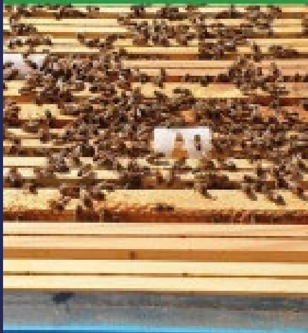
Figure 30: Synthetic pesticide strips applied to a colony in autumn