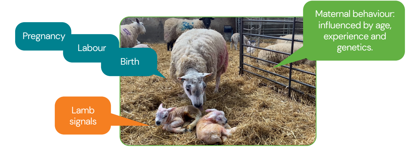
Figure 1: The lambing process: The first-time lamber has to navigate a lot of new experiences – give her time and space to express maternal behaviour naturally.

Whether lambing as ewe lambs or as gimmers, the process is new to the ewe and therefore they need additional attention, regardless of age.