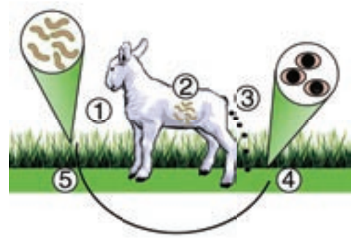
Fig 1: Life Cycle of the Common Abomasal and Gutworms of Sheep.