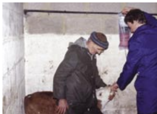
Oral rehydration fluids administered to a calf that has scoured

Scour is the passing of abnormally high amounts of fluid in the faeces. This may be due to excessive passing of fluid into the intestine from the body or the failure to absorb a sufficient quantity of fluid from the contents of the intestine during the digestion process. As a result the nature of the faeces can vary from a pasty texture to pure liquid. Depending on the severity of disease, blood and the products of