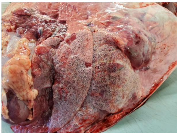
Figure 1 – Typical RSV-associated pathology in a four-month-old weaned calf

A four-month-old Belgian blue cross calf was found dead of suspected pneumonia. It had been purchased two months earlier and vaccinated against IBR and Mannheimia haemolytica . Postmortem examination identified anteroventral sub-pleural emphysema (Fig 1) suggestive of infection with bovine respiratory syncytial virus (BRSV). There was additional interlobular emphysema and large emphysematous bullae in the diaphragmatic lobes plus localised areas of consolidation in the anterior lung lobes. RSV, Mycoplasma bovis and Pasteurella multocida were detected by PCR carried out on lung tissue and histopathology confirmed active lesions consistent with RSV and M bovis infection. RSV was a frequent diagnosis in south-west Scotland during November, but this does not appear to have been replicated in other areas.