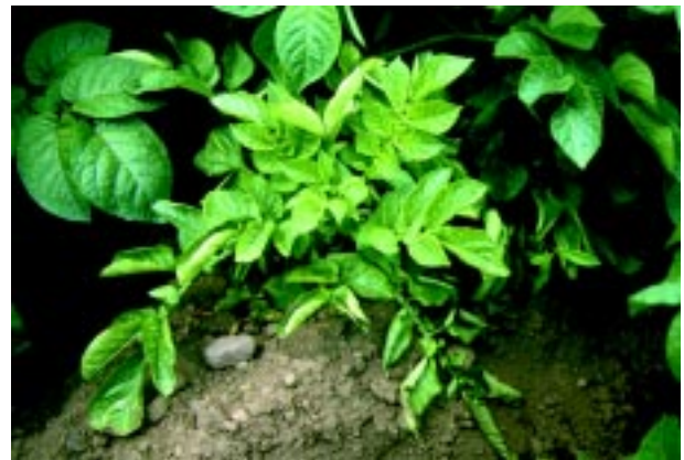
Figure 1: Potato leaf roll (PLRV) symptoms

PLRV is a persistent virus, which means that it is acquired from infected plants by aphids only after a feeding period of several hours, and transmission by the aphid is then delayed for several hours because the virus has to pass through the digestive system of the aphid and replicate in its salivary glands before transmission may occur. Once the virus has been acquired by an aphid, the aphid remains infective for the rest of its life.