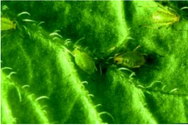
Figure 3c: Glasshouse and potato aphid