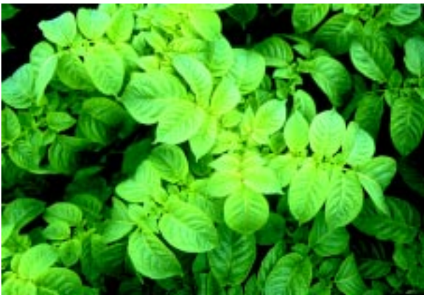
Figure 2: Veinal necrosis (PVY N ) symptoms

PVY N (Fig. 2) and PVA symptoms tend to be less distinct, showing only as a mild mottle, referred to as mild mosaic. Nevertheless, there is a loss of vigour and yield potential in plants arising from infected tubers, particularly if more than one virus is present in a plant.