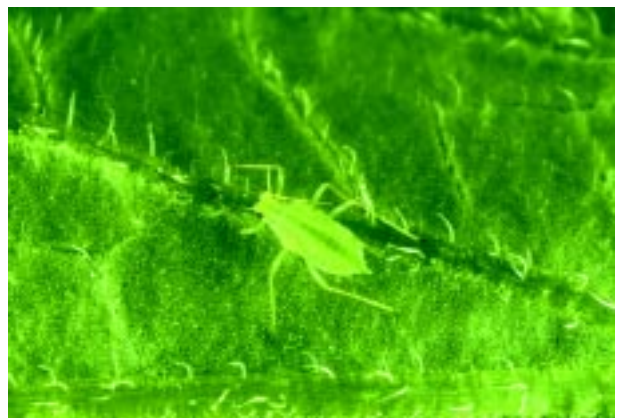
Figure 3b: Potato aphid

The potato aphid ( Macrosiphum euphorbiae ) which overwinters on weeds and roses (Fig. 3b) is usually the first species to appear on potato crops. Whilst it is not as effective a virus vector as the peach-potato aphid and is not known to transmit PLRV in Scotland, its numbers can build up rapidly on the upper leaves of plants and cause 'false top roll' of the leaves.