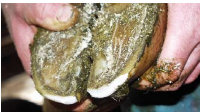
Figure 7: Toes trimmed to correct length.