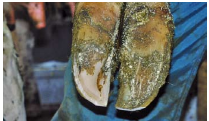
Figure 8: Inner claw sole thickness reduced at toe.