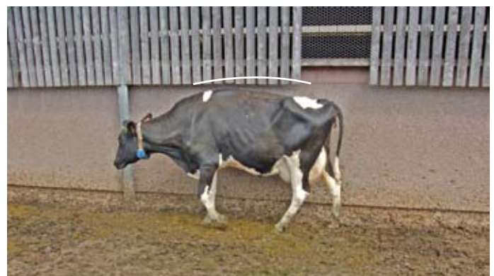
Figure 6: Locomotion scoring (walking lame)

The simplest scoring system is three categories (sound, uneven / slow and lame). Lame cows (figure 6) tend to walk more slowly with uneven