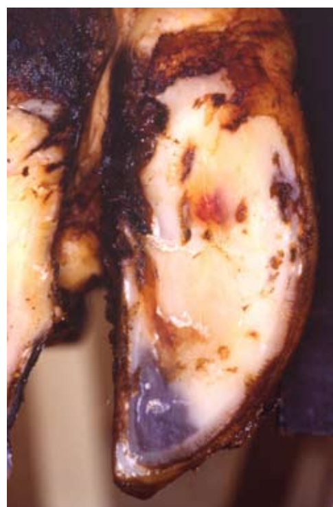
Figure 3: Sole haemorrhage