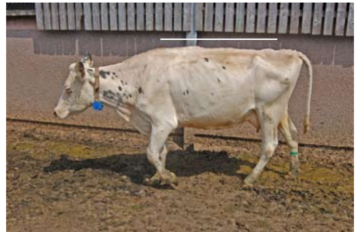
Figure 5: Locomotion scoring (walking sound)

Locomotion scoring is a reproducible technique that can identify severely lame, moderately lame and sound cows (figure 5). If used in conjunction with routine foot trimming (below), it can identify lameness cases early and stop them developing into a more severe lameness that is difficult to treat.