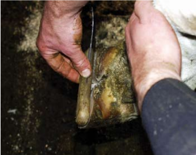
Figure 10: Knife is used to check each claw is level.