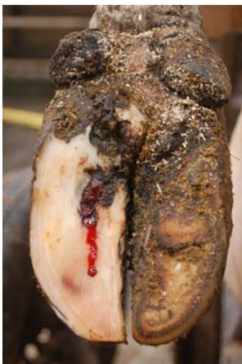
Figure 2: Sole ulcer