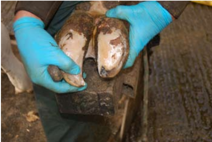
Figure 4: White line abscess

The horn of the white line is softer than that of the sole or wall. As a result, foreign materials such as slurry, soil and stones are more likely to penetrate the white line than the sole. They can introduce bacterial infection and result in pus and an abscess that causes severe and acute onset lameness (figure 4).