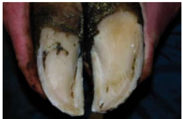
Figure 9: Inner aspect of each claw “dished out” to relieve non-weight bearing surface.